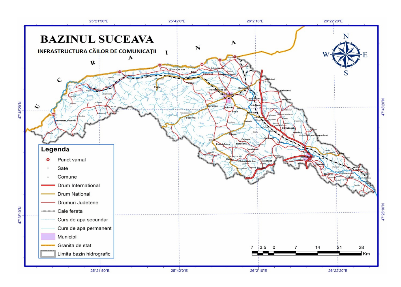
Figure no. 1. Suceava Basin – The infrastructure of the communication ways (Author Constantin Cocerhan)

Distances to the main tourist centers nearby (Radauti, Sucevita, Solca) and turistic objectives, often exceed 50 km, many sights being relatively isolated.