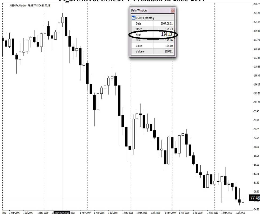
Figure nr. 3. USD/JPY evolution in 2006-2011

As can be seen from the graph above, the decline trigger point in the dollar yen happened in mid 2007 when, after a June which brought new strengths in the USD/JPY, August brought a dramatic decrease, with a long descent equal to the sum last three months of growth. It may be noted that the following candles are longer than the time before panic took over the housing market. In fact, panic is one of the strongest factors influencing the forex market, resulting in abrupt movements.