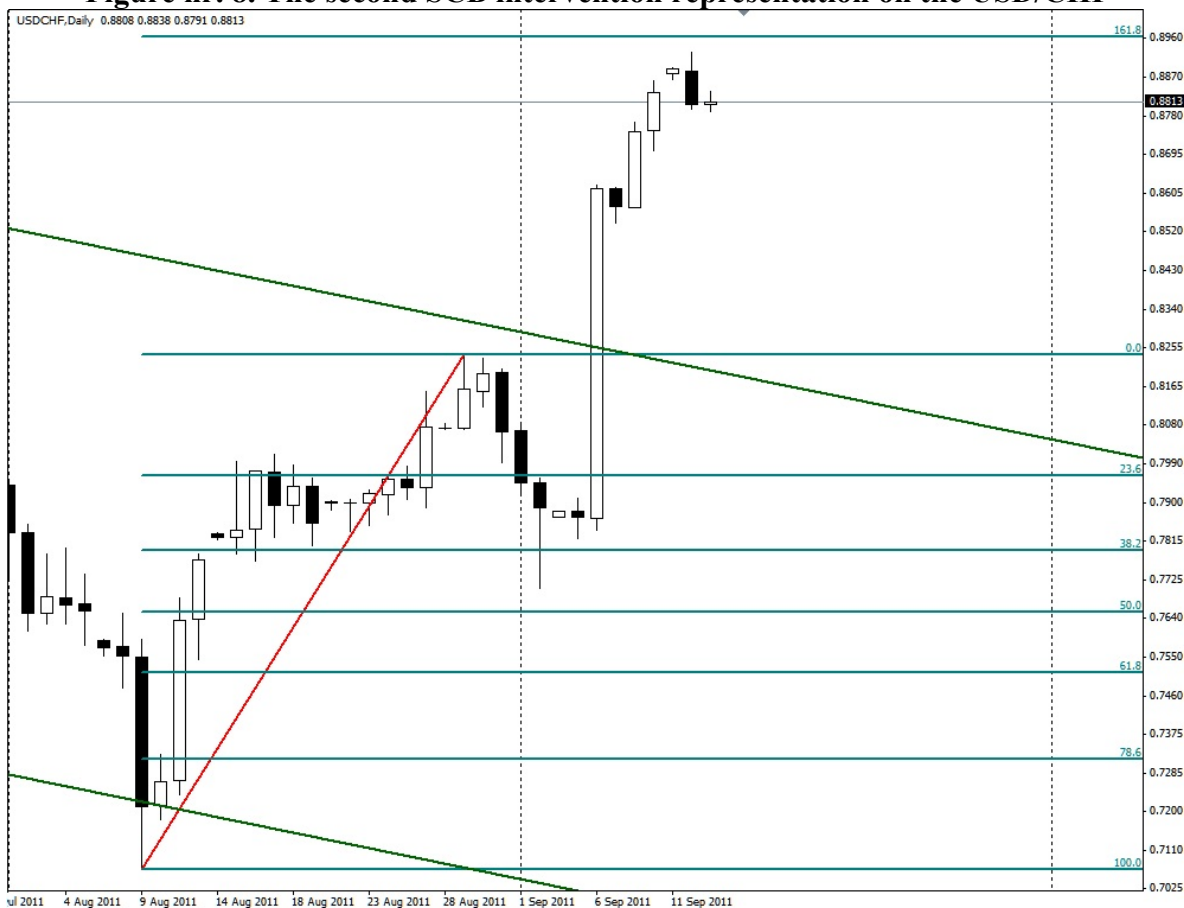
Figure nr. 8. The second SCB intervention representation on the USD/CHF

You can see how the Fibonacci 38.2% which coincided with the round number 0.89 CHF/USD, formed a period of indecision, the market waited for clues on the direction it will go further. The hint came on September 6th, when the Swiss National Bank announced how it will implement action to combat forced appreciation of the franc, namely the introduction of a system of fixed rates established at 1.2 francs for one euro. The following resolute reaction of the market can be seen with naked eye, the market moved in a single day 800 pips, which translated means a depreciation in real terms by about 10% of the franc against the U.S. dollar. It is a clean break of the trend line, with a candle without long and too obvious wicks, which gives even more credibility from the technical perspective. The pair stabilized in a key area also, that of the 161.8% Fibonacci extension level, which coincides with round number 0.89 CHF/USD and other support and resistance levels earlier.