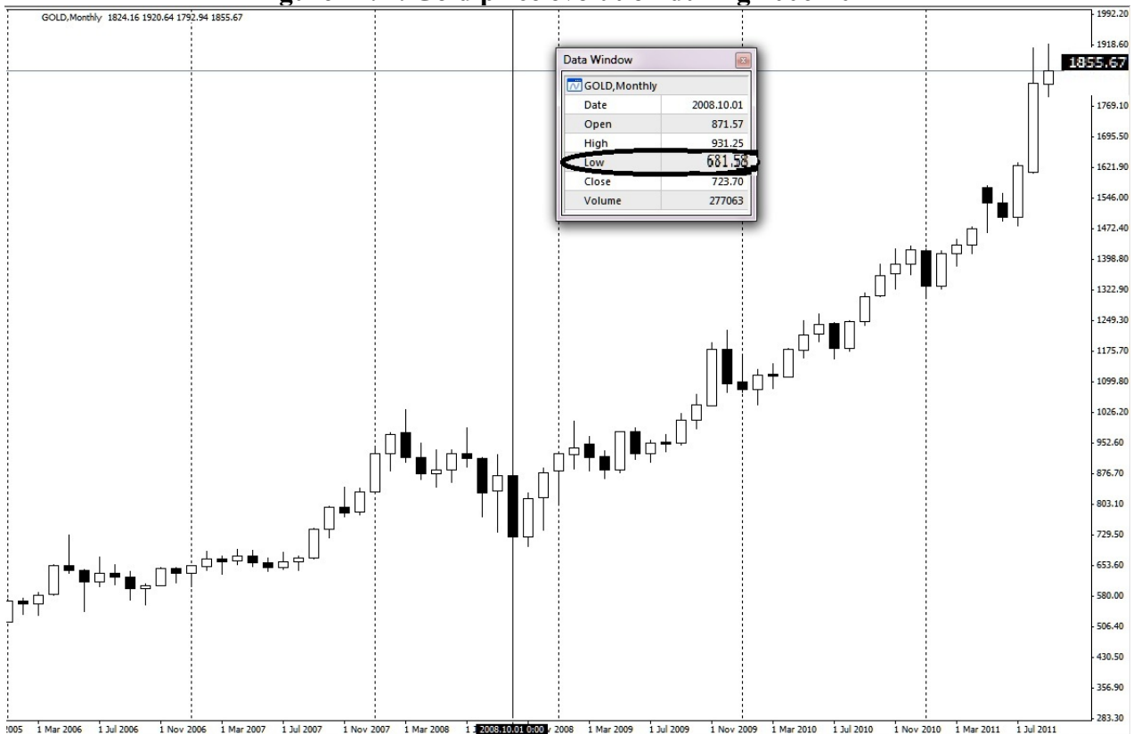
Figure nr. 1. Gold price evolution during 2006-2011

It should be noted that the market prices provided by the Market Maker are the real ones used worldwide, but they can oscillate with a maximum of 2-5 pips to other serious trading platforms, be they Romanian or foreign. Drawn with white candles are representations for price increase, and black candles for decrease.