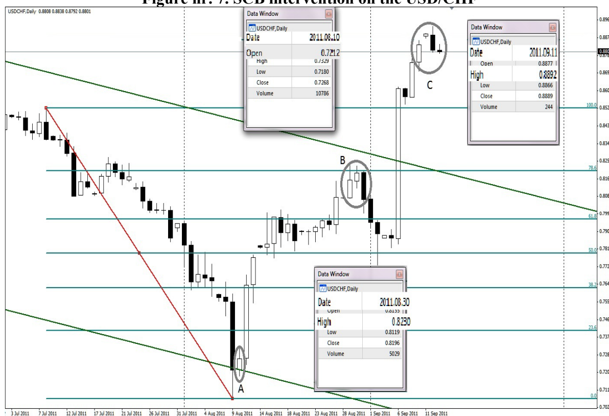
Figure nr. 7. SCB intervention on the USD/CHF

From previous representation I wanted to highlight on the one hand the movement caused by the announcement of starting to fight against franc appreciation, and on the second hand the strict way the chart respected technical analysis elements. Thus, climbing started at 0.72 CHF/USD, rising to the resistance formed by the convergence between the trend line, then the 0.82 CHF/USD level which is a round number, that play a natural support and resistance role, while achieving the Fibonacci resistance level of 78.6% from the previous impulse.