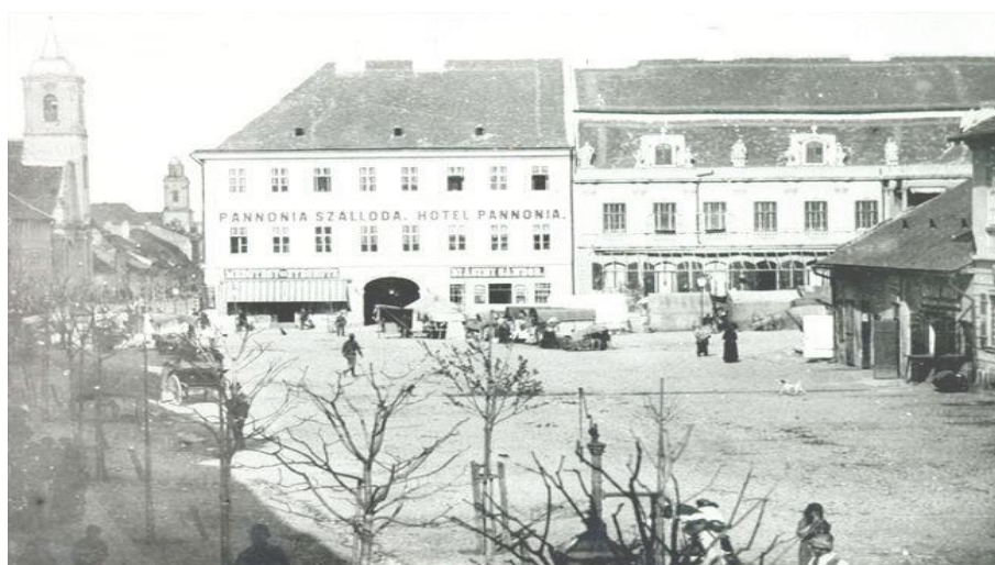
Figure no. 4 Pannonia Hotel in 1887

Opened in the 50's, Hotel Melody is known as the Cluj first jazz nightclub in the postwar period. Instead of the current hotel there were originally two buildings: the city fiscal's office, later the "Fiskus" pub and a hotel named Pannónia (figure no. 4). It is said that in the Fiskus pub were helped getting drunk young peasants who came to Cluj and they woke up soldiers in the Imperial (Austro-Hungarian) Army in which the military service lasted long time (between ten to twenty years depending to the situation).