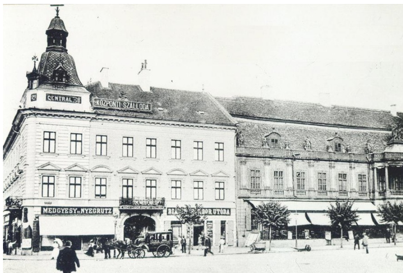
Figure no.5. Central Hotel in 1914