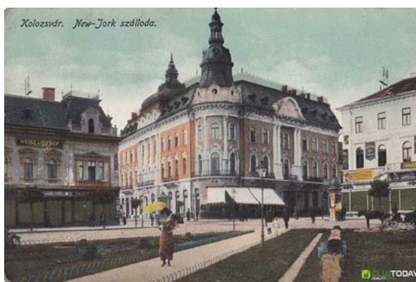
Figure no. 2. New-York Hotel

At the ground floor functioned, more than half a century, a literary and press café where the literary and artistic elite of Cluj always were used to spend their free time. Here was created the literary journal "Gandirea".