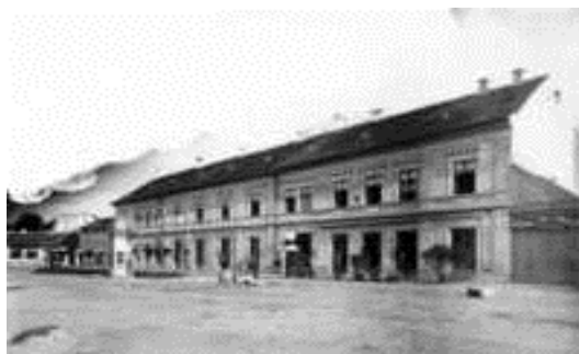
Figure no. 1. Biasini Hotel

In 1837 Biasini bought the Szacsvey Inn, located in front of the Gate Tower of Turzii Street. Instead the inn he built a hotel and café, which accounted for many decades a major cultural center of the city.