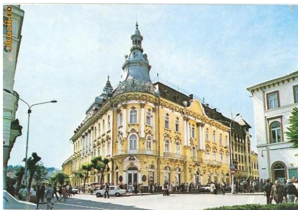
Figure no. 3. Continental Hotel in 1988